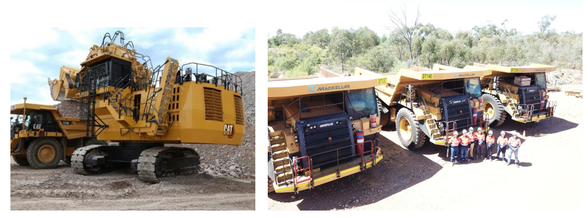
Figure 1: Proposed Mackellar fleet

Non-acid forming waste rock will be used to encapsulate the existing heap leach pads as well as any potentially acid forming waste from the pit. The use of the waste rock from the cutback to cover the heap leach pads saves considerable expense in closure activities later in the mine life.