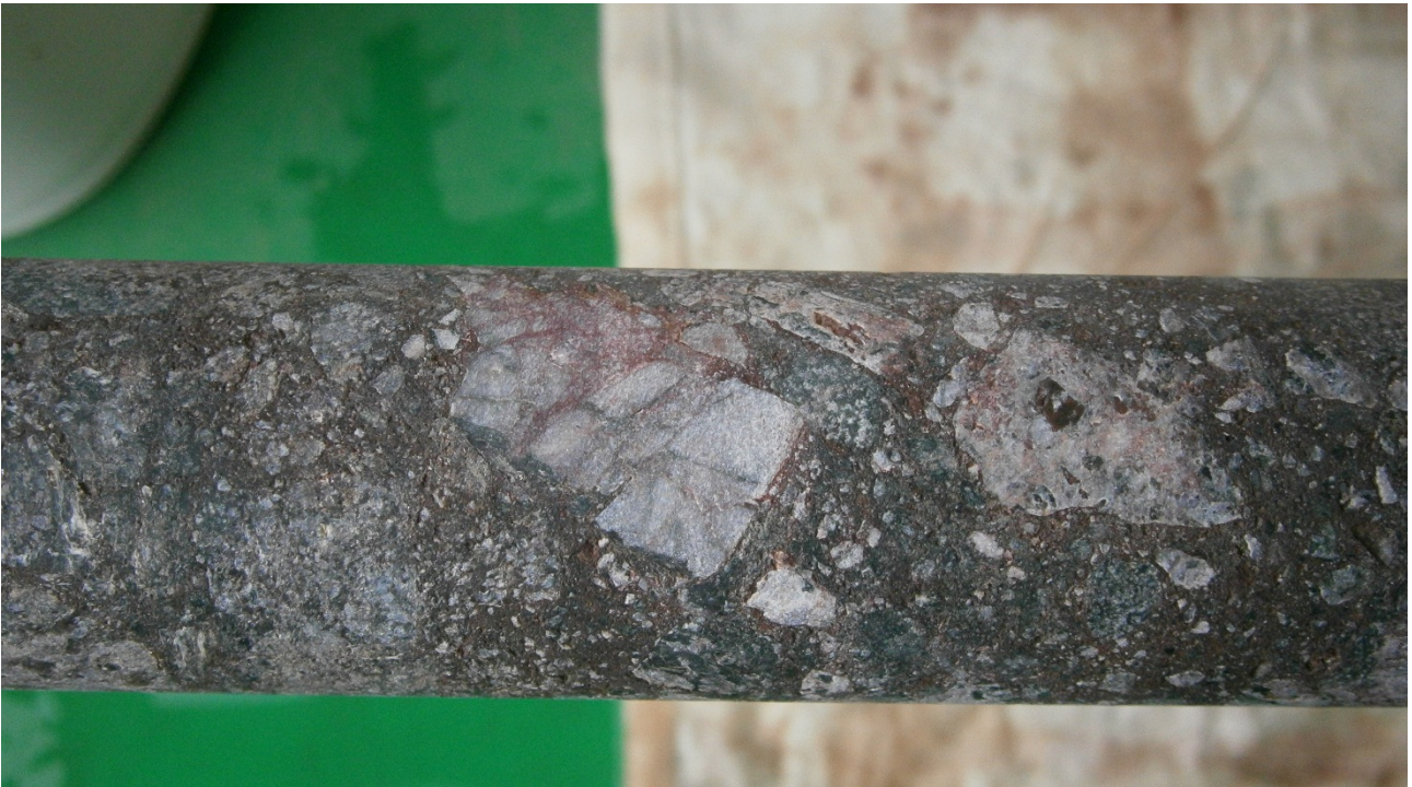
UGSDD001 – 1142.4m – Hematite breccia showing angular clasts of quartz and granitoid (BQ core)

The drill rig has commenced drilling at UXA's Oak Dam tenement to test the third geophysical target. On completion, Straits intends to review the results of all three holes in preparation of the next phase of drilling.