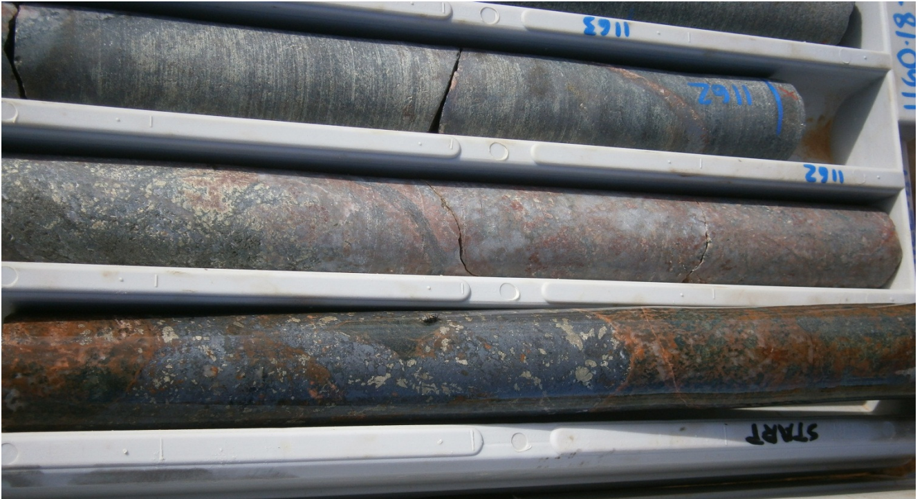
UGSDD001 – Altered granitoid with magnetite-hematite-pyrite-carbonate veining from 1161m (BQ core)