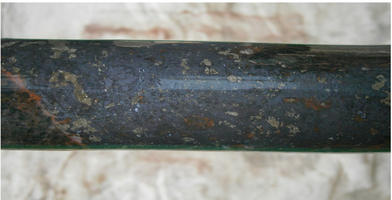
UGSDD001 – Close up of magnetite-pyrite-hematite-carbonate- chalcopyrite (minor) vein at 1161m (BQ core) in altered granitoid.