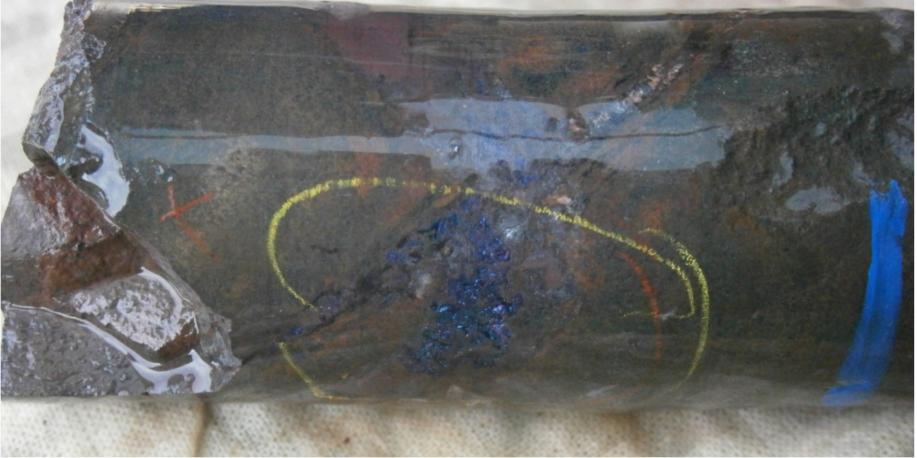
UGSDD001 – 1107.4m. Close up of bornite within magnetite-hematite-pyrite-carbonate veining in altered mafic(?) rock (BQ core)