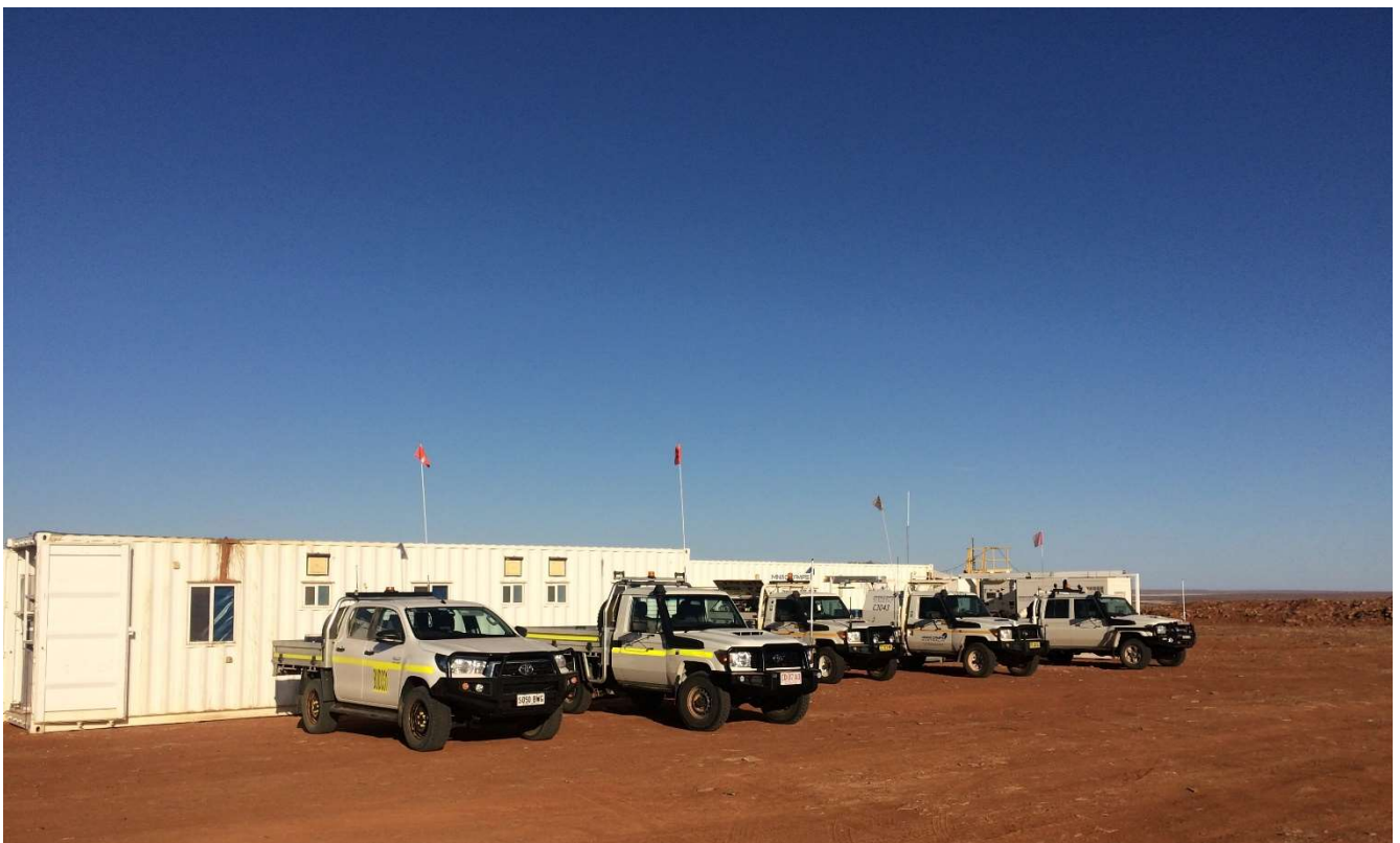
Figure 1: View of the Torrens exploration camp toward Lake Torrens.

Within the Torrens Project area, geophysical modelling/interpretation has identified 28 geophysical anomalies based on gravity and magnetic geophysical datasets. Limited drilling, totalling 6 drill holes between 1977 and 2008, defined a large magnetite dominant with lesser hematite alteration system interpreted to form the distal component of a large IOCG system. Zones of anomalous copper mineralisation ( \geq 0.1\% Cu) were intersected from several drill holes with the most significant mineralised zone associated with TD2 (246m @ 0.1% Cu).