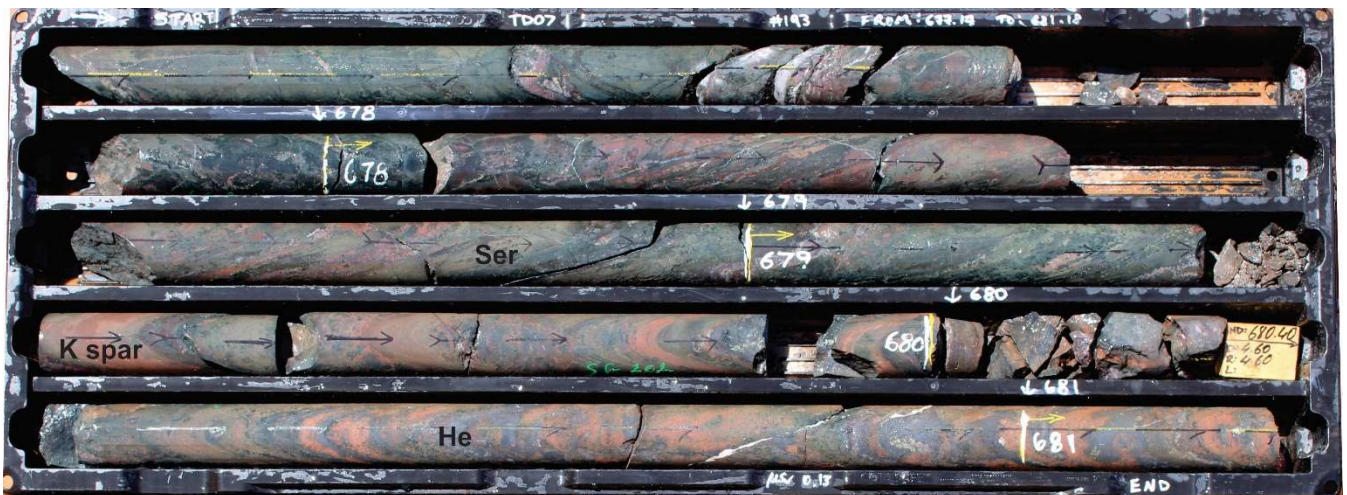
Figure 1: TD7 core photo from 677.17m downhole showing dark grey hematite bands (He) within a K feldspar (K spar) and sericite (Ser) dominant alteration assemblage.

Drill core from TD7 will be transported to Adelaide for sample preparation (core cutting) and assaying next week, with assay results expected in towards the end of April.