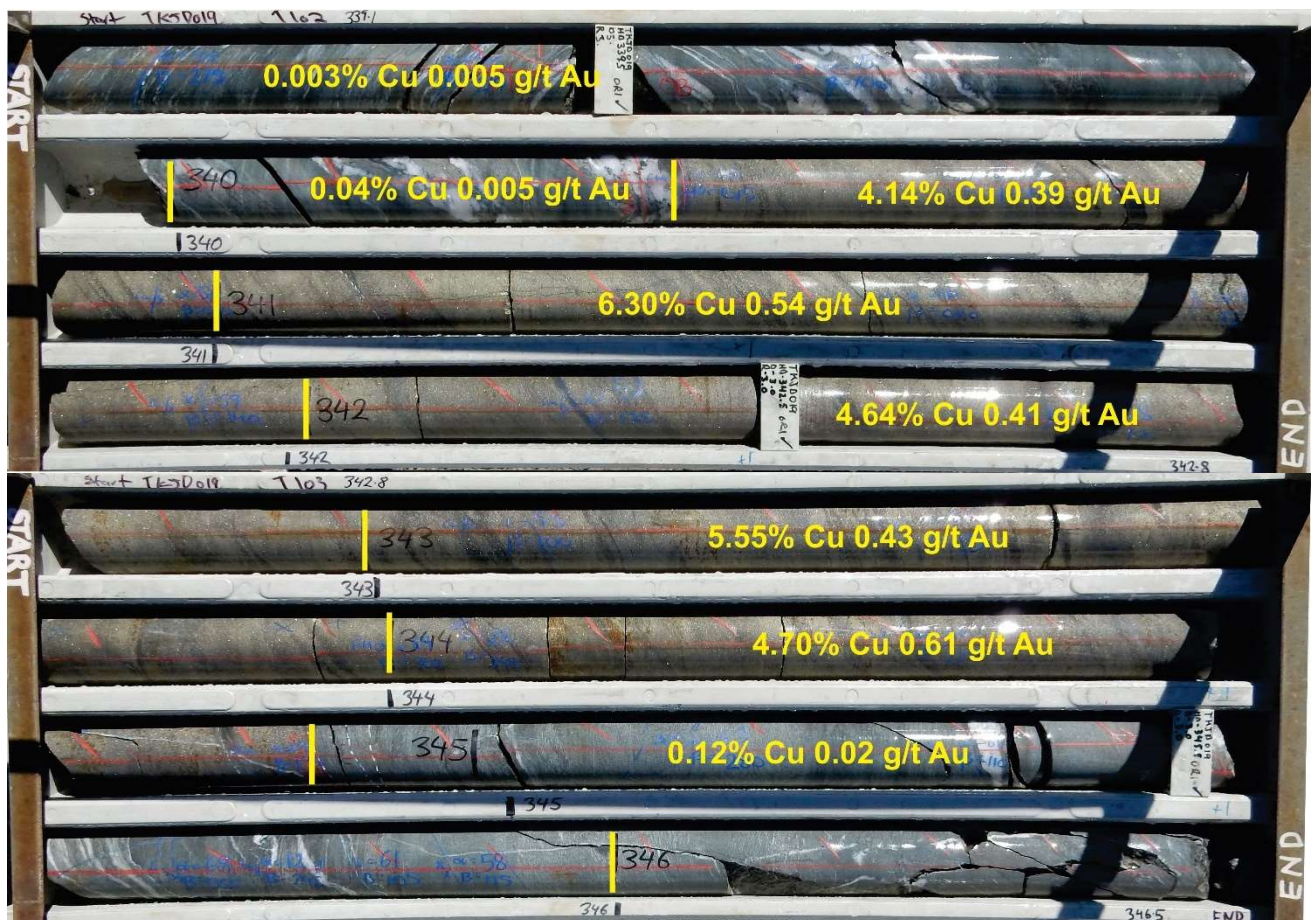
Figure 2 – TKJD019 high grade copper sulphide mineralisation.

The dimensions of the massive sulphide domain average 70 metres (strike) x 800 metres (down plunge) x 5 to 10 metres (thickness). In comparison the larger banded sulphide domain dimensions are 100 metres (strike) x 1,100 metres (down plunge) x 10 to 20 metres (thickness). The sulphide domains are defined by an elongated and shallow plunging (30°) corridor.