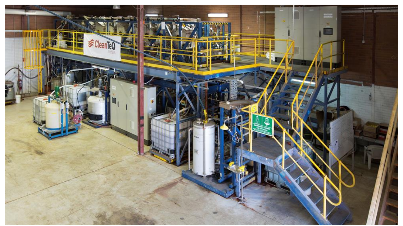
Clean TeQ's proprietary Resin-In-Pulp (cRIP) process demonstration plant

A key focus for the Company is securing offtake contracts to eventually support the levels of scandium oxide production proposed in the Scoping Study. As per the ASX announcement of 3 March 2016, Clean TeQ marketing personnel are working with a number of counterparties in the global aerospace and solid oxide fuel cell sectors with the aim of securing scandium oxide offtake contracts. In addition to these opportunities, a number of opportunities have been highlighted in automotive and space using Al-Sc sheet, welding wire, extruded parts and powder, which will provide other additional sources of offtake in the future.