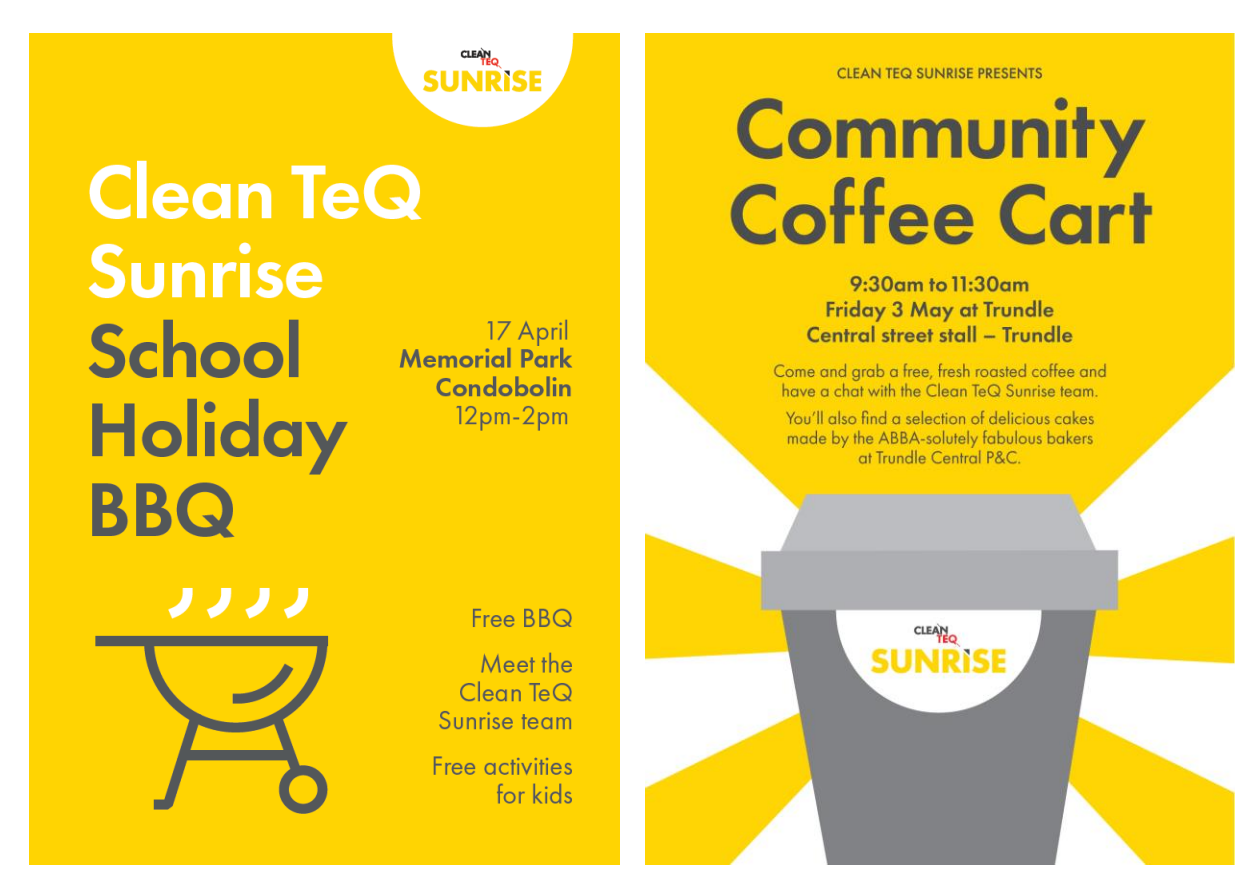
Figure 2 - Clean TeQ community engagement activities

A range of forums have been established to enable positive community engagement including a formal Community Consultative Committee (CCC) and a more informal, travelling "Coffee Cart". Local schools are invited to partner with the coffee cart program, with proceeds used for education initiatives such as the purchase of student iPads. Clean TeQ is also supporting student Breakfast Clubs at a number of schools in the region.