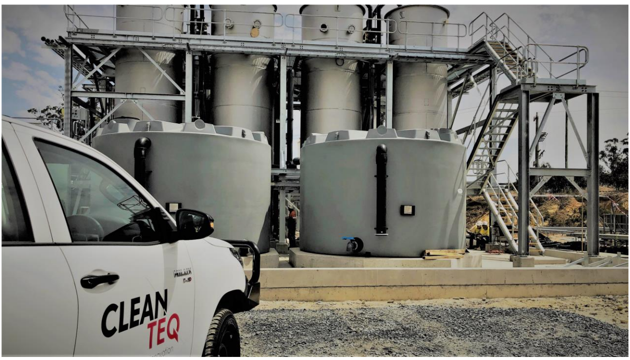
Figure 3 - Clean TeQ plant installation at Fosterville Gold Mine, Victoria

In Oman, engineering, delivery and construction of the Clean TeQ waste water treatment plant delivered in partnership with Multotec Process Equipment Ptd Ltd (Multotec) has been completed. The final commissioning phase will commence later this year when the customer begins delivering waste water to the CIF® plant for treatment.