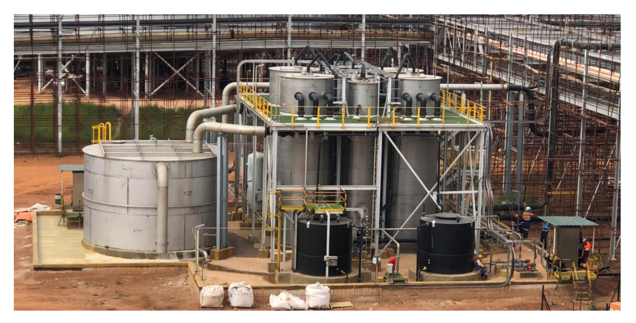
Figure 5 - Clean TeQ Continuous Resin-In-Column Ion Exchange plant in DRC

In the DRC, Clean TeQ has been engaged to design and construct a Continuous Resin-In-Column (cLX) Ion Exchange plant to treat up to 20 million litres-per-day of a raffinate stream, removing contaminant metals and improving the quality and environmental rank of the raffinate, prior to further processing. All construction was completed during the quarter with hot commissioning commencing. Initial tests showed that the cLX plant was performing well, exceeding design expectations. However, an accidental uncontrolled release by the mine owner/operator of very high-pressure water from the main plant into the cLX system resulted in some damage being caused to the Clean TeQ plant, taking it offline. The damage is currently being repaired with some additional modifications being installed upstream of the cLX plant to prevent a similar event occurring again. Expectations are for a restart of the plant over the coming weeks.