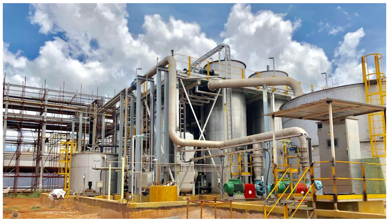
Figure 6 - Clean TeQ Continuous Resin-In-Column Ion Exchange plant in DRC