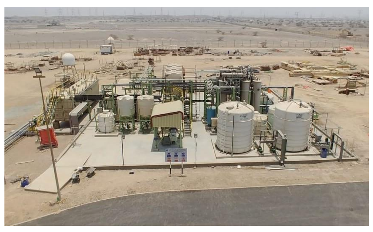
Figure 4 – Clean TeQ CIF® plant constructed and awaiting commissioning in Oman

In Oman, engineering, delivery and construction of the Clean TeQ waste water treatment plant delivered in partnership with Multotec Process Equipment Ptd Ltd (Multotec) has been completed. The final commissioning phase will commence later this year when the customer begins delivering waste water to the CIF® plant for treatment.