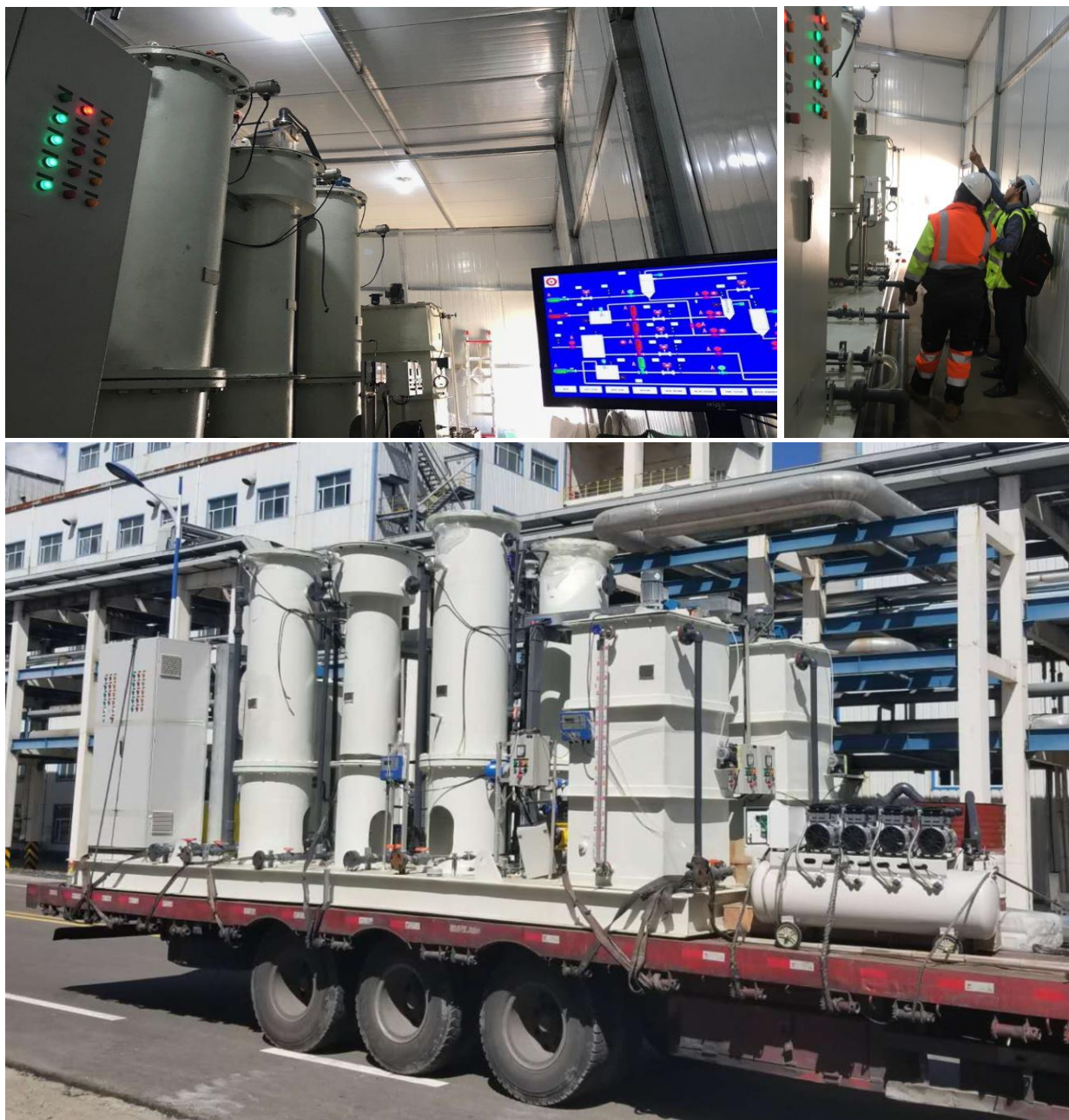
Figure 5 – Clean TeQ Continuous Ionic Filtration (CIF®) Mobile Demonstration Plant

During the quarter Clean TeQ successfully completed a hardness removal demonstration project in Inner Mongolia for Jiutai New Material ( Jiutai ).