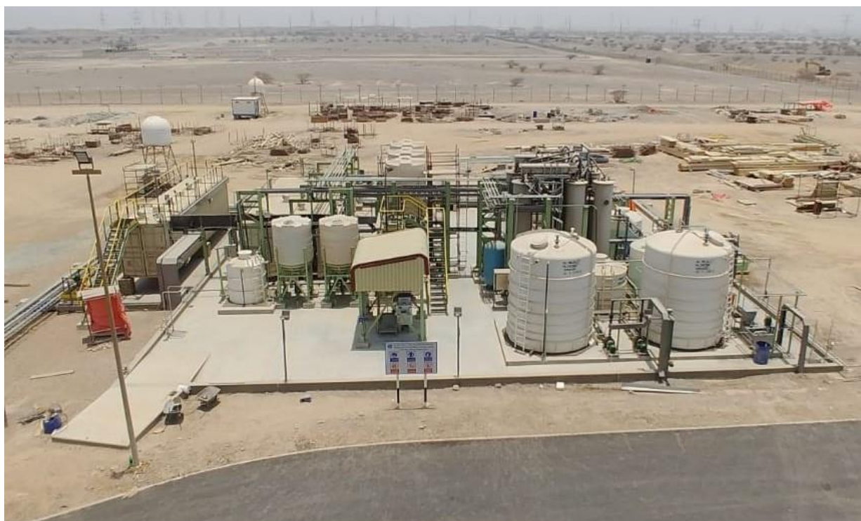
Figure 2 – Clean TeQ CIF ® plant constructed and awaiting commissioning in Oman

In Oman, engineering, delivery and construction of the Clean TeQ waste water treatment plant delivered in partnership with Multotec Process Equipment Ptd Ltd ( Multotec ) has been completed. The final commissioning phase will commence later this year when the customer begins delivering waste water to the CIF ® plant for treatment. Based on the latest overall plant completion schedule advised by the customer, commissioning of the Clean TeQ plant is expected to commence in Q3 of 2019.