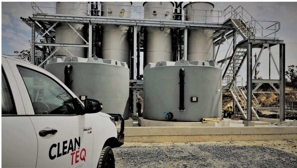
Figure 1 - Clean TeQ plant installation at Fosterville Gold Mine, Victoria

Clean TeQ Water is focused on completing key projects in Australia, Oman, DRC and China, with continued strong progress made over the past quarter.