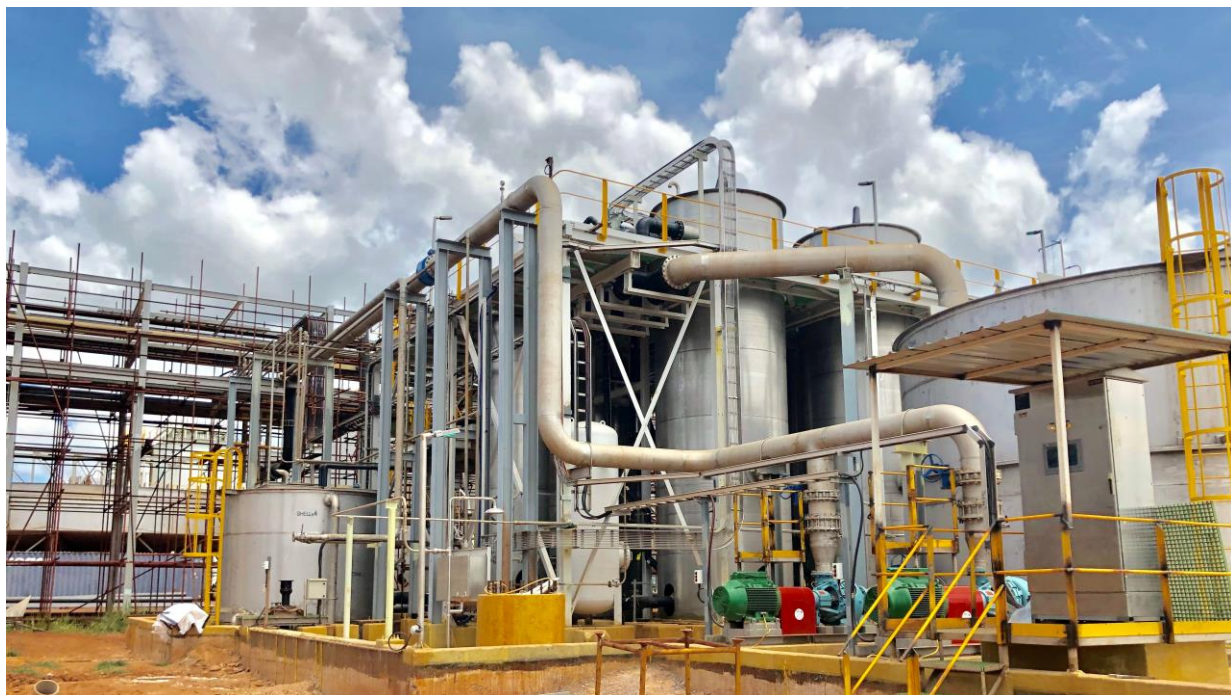
Figure 4 – Clean TeQ Continuous Resin-In-Column Ion Exchange plant in DRC