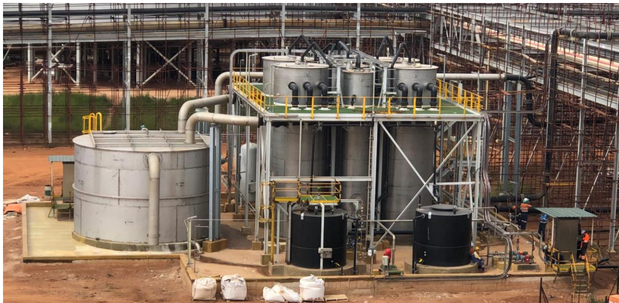
Figure 3 – Clean TeQ Continuous Resin-In-Column Ion Exchange plant in DRC

the cLX plant was performing well, exceeding design expectations. However, an accidental uncontrolled release of very high-pressure water from the main plant into the cLX system resulted in some damage being caused to the Clean TeQ plant, taking it offline. As well as the damage caused by the high-pressure release, significant corrosion was identified in some parts of the plant which were provided to the customer by a third-party equipment supplier. The damage is currently being repaired and some additional modifications are being installed upstream of the cLX plant to prevent a similar event occurring again. Expectations are for a restart of the plant over the coming months, with performance testing of the cLX system in Q4 2019.