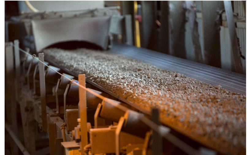
Crushed ore through the processing plant