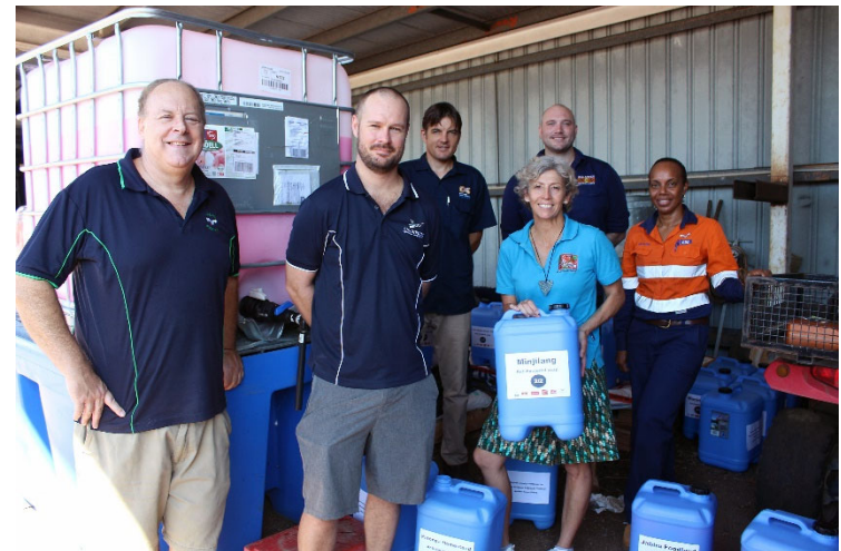
Working with local partners to distribute sanitiser product to communities to help prevent the spread of COVID-19