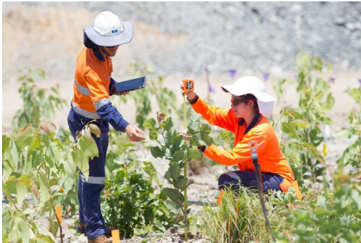
Close monitoring of Stage 13