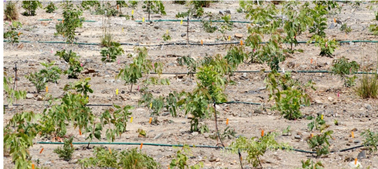
Stage 13 planted and irrigated