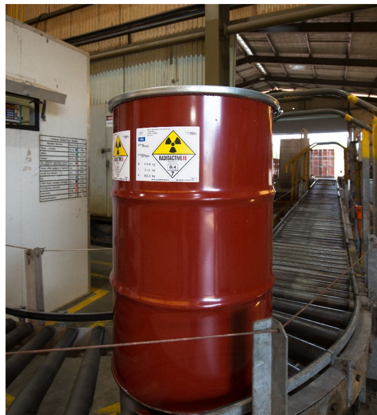
Final drum of product packed on the 8 January 2021 ready for transport