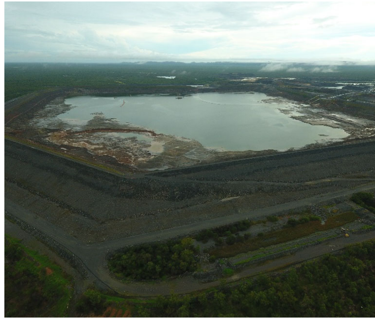
Tailings Storage Facility January 2021 (bulk tailings transfer completed in February, with floor cleaning to progress)