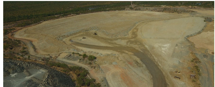
Pit 1 bulk backfill completed 17 August 2020