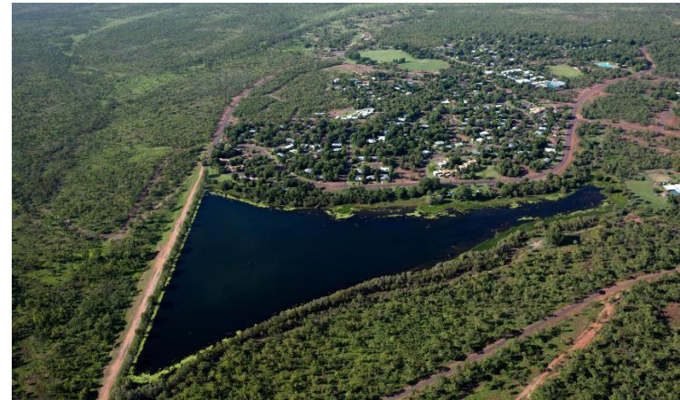
The town of Jabiru forecast to transition to a new head lease in 2021