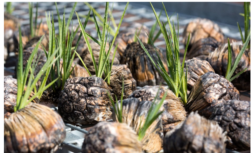
Germinated Pandanus spiralis fruits to be used for revegetation in 2021