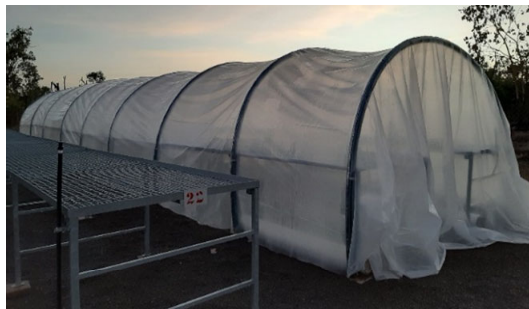
Seed germination and propagation