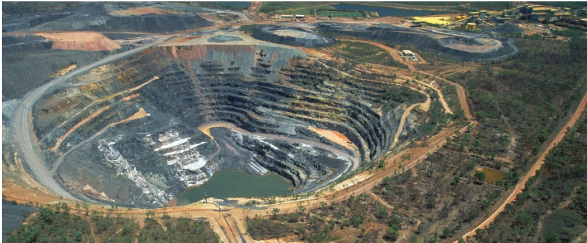
Pit 1 1992