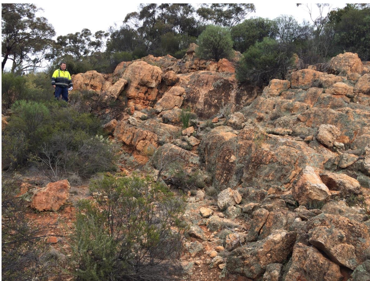
Photo - Mt Marion Lithium Project – Outcropping Spodumene Pegmatite on recently acquired Metals X ground immediately north of the planned mining pits.

The MOU enables Jiangxi Ganfeng Lithium Co. Ltd to acquire 25% of the MRL and Neometals jointly owned subsidiary Reed Industrial Minerals ( RIM ) and enter into an off-take agreement for up to 100% of the spodumene production at RIM's discretion. The Mt Marion project is fully permitted for mine development. Development plans for the project are being progressed and subject to a satisfactory outcome on due diligence and associated approvals, first concentrate production is targeted to commence by mid-2016. The recent acquisition of the lithium rights on Metals X Ltd's ground (as announced to the ASX by NMT on 7 July) has provided an opportunity to further optimise the mine designs and plant location.