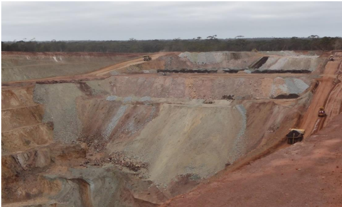
Photo – In pit dumping in the south end of the Carina open pit