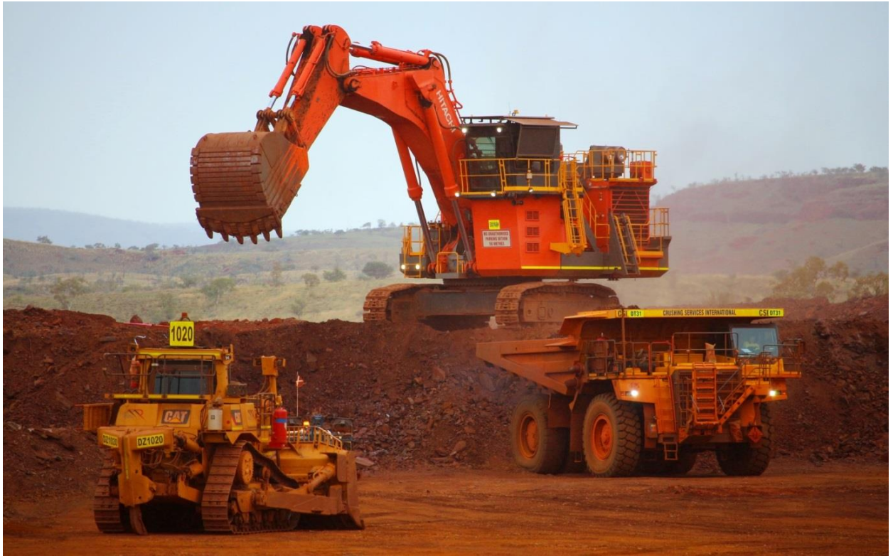
Photo - Low cost bulk mining at Iron Valley