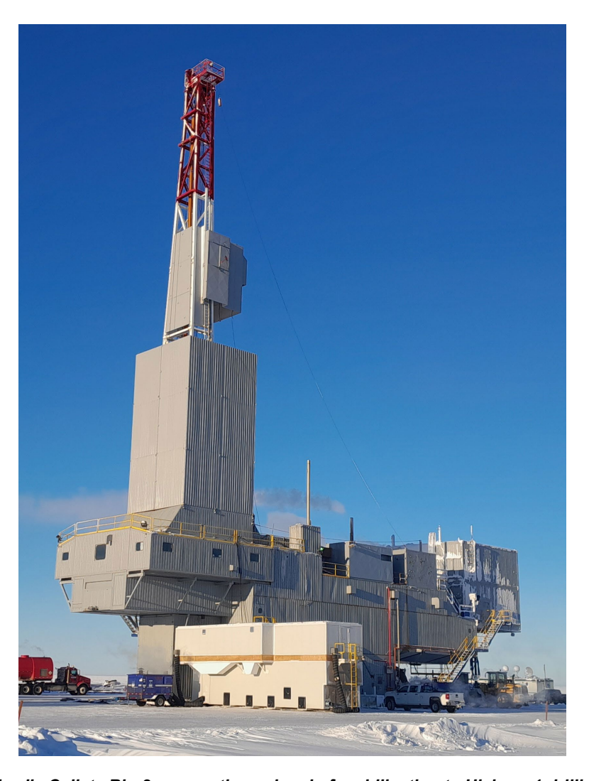
Figure 2: Nordic Calista Rig-2 preparations ahead of mobilisation to Hickory-1 drilling location