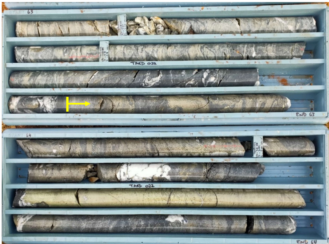
Figure 2 – Drill hole TAKD022 drill core photographs showing the sulphide horizon intersected from 228.6m down hole. Yellow arrows denote the sulphide interval.

Drill hole TAKD022 was designed to test the mineralised system 50m along strike (south) from TAKD005 2 (2.5m @ 6.10% Cu) and TAKD006 2 (5.85m @ 4.60% Cu). TAKD022 intersected an approximate 20m thick sulphide interval (assays pending) from 228.6m downhole. Massive sulphide lenses are prevalent throughout the sulphide interval (refer to Figure 3 below).