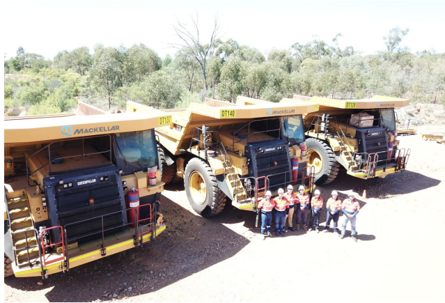
Figure 1: Proposed Mackellar fleet

Non-acid forming waste rock will be used to encapsulate the existing heap leach pads as well as any potentially acid forming waste from the pit. The use of the waste rock from the cutback to cover the heap leach pads saves considerable expense in closure activities later in the mine life.