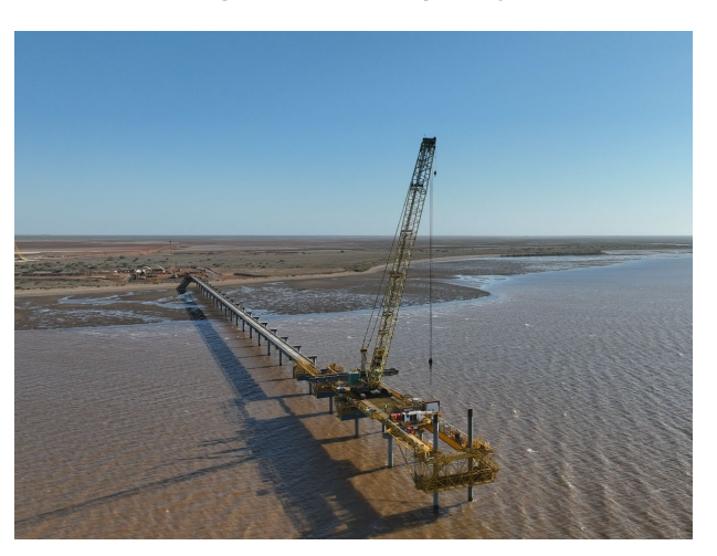
Figure 4: Jetty progress – 14.75%

BCI has also continued to make considerable progress in engineering and design. Progress on the Secondary Seawater Intake channel and pond design stands at 50%. Additionally, engineering efforts for the salt wash plant have advanced, with an agreed initial layout, and pilot plant testing awarded. Test work on the SOP flowsheet has also commenced at a specialist facility.