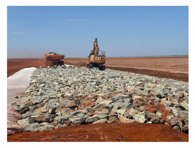
Figure 2: Pond 3 spillway