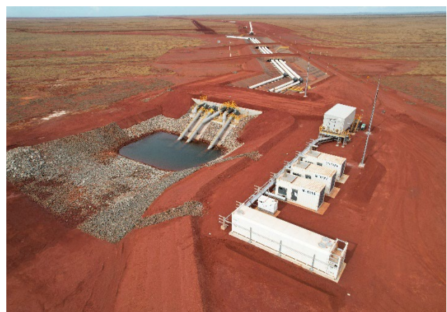
Figure 2: Transfer station 2/3