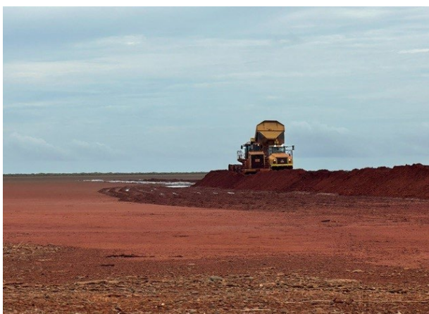
Figure 1: Pond 6a levee

Q-Birt was awarded the contract for civil works on the primary, secondary, and KTMS crystallisers, with mobilisation and large-scale earthmoving equipment arriving at site during the quarter. Mesquite clearing continued with 239 hectares cleared in the crystalliser area, and foundation preparation of the first embankment walls has commenced.