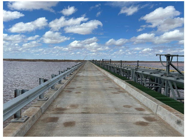
Figure 4: Jetty permanent road and conveyor truss

Engineering and design have also seen significant progress, with the secondary seawater intake channel and associated infrastructure design now complete. The salt wash plant FEED design and pilot testing have also been completed, and testing equipment has been supplied and commissioned. Additionally, the optimised design for the Pilbara Ports Authority (PPA) access road has been submitted, and preliminary PPA review responses have been received.