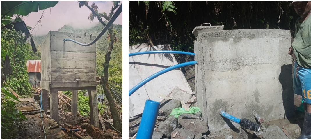
Photos 2&3 Newly-constructed water distribution tank (left) and intake tank (right)

The company continues to support educational initiatives in conjunction with the Department of Education. This includes alternative modes of learning to enable students to continue their education despite the challenges of the Covid Pandemic. This includes the installation of a local area network at the local high school.