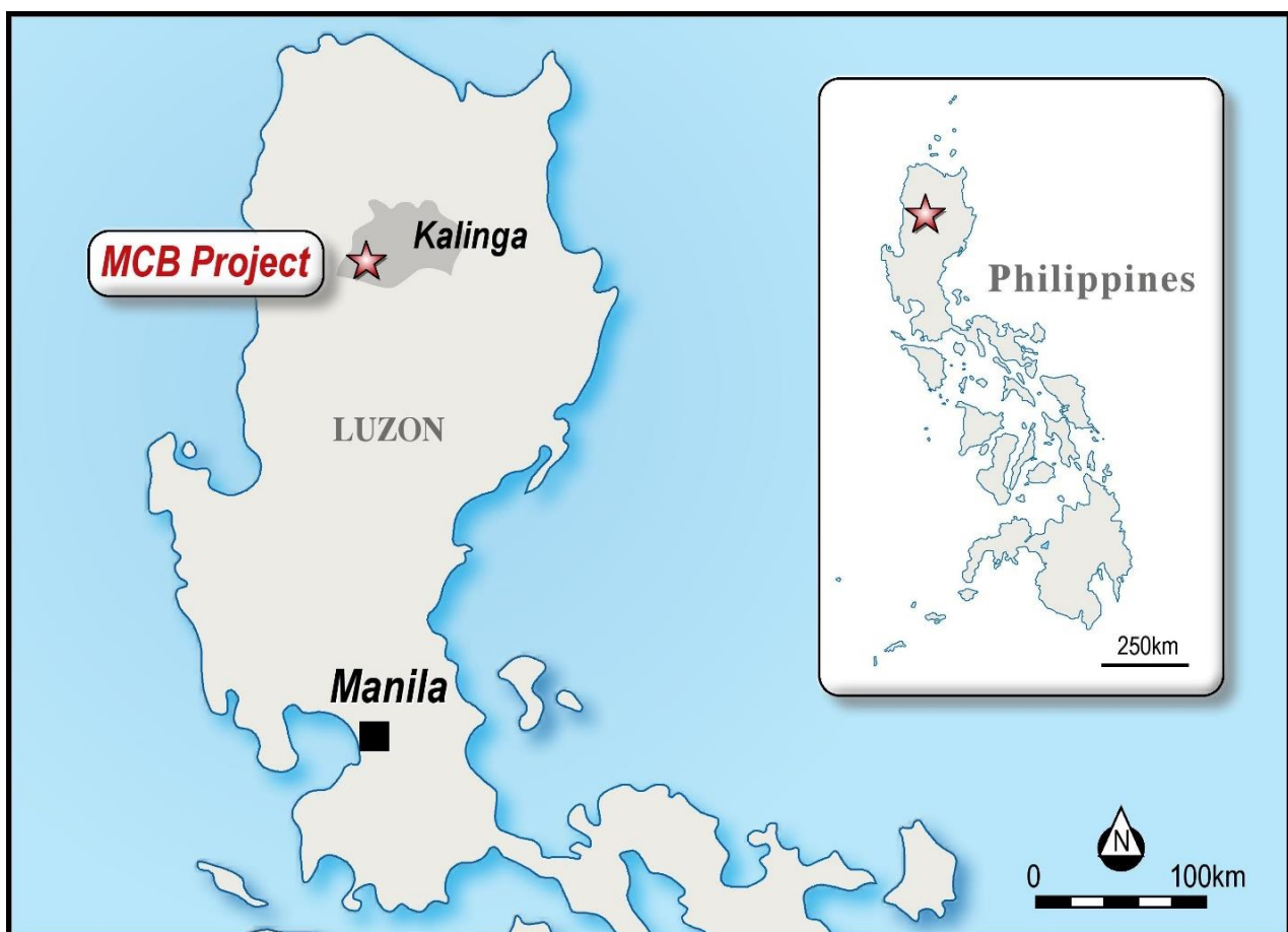
Figure 3: Location of the MCB Project in the province of Kalinga, Northern Luzon, Philippines.

Highlights from the Scoping Study include a Post tax NPV (8%) of US$464m and IRR of 35%, assuming a copper price of US$4.00/lb and gold price of US$1,695/oz. Initial capital expenditure is estimated to be US$253m with a payback period of approximately 2.7 years. The designed mine production is matched to a 2.28Mtpa processing plant which will treat ore with an estimated average grade of 1.14% copper and 0.54g/t gold for the first 10 years of planned production with a C1 cash costs at just US$0.73/lb copper, net gold credits