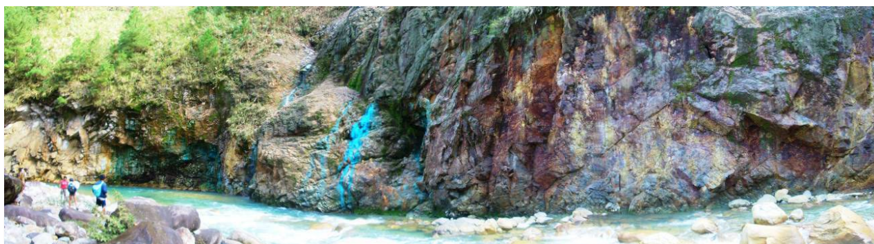
Figure 2. Blue and green copper minerals observed along the walls of the Botilao outcrop.