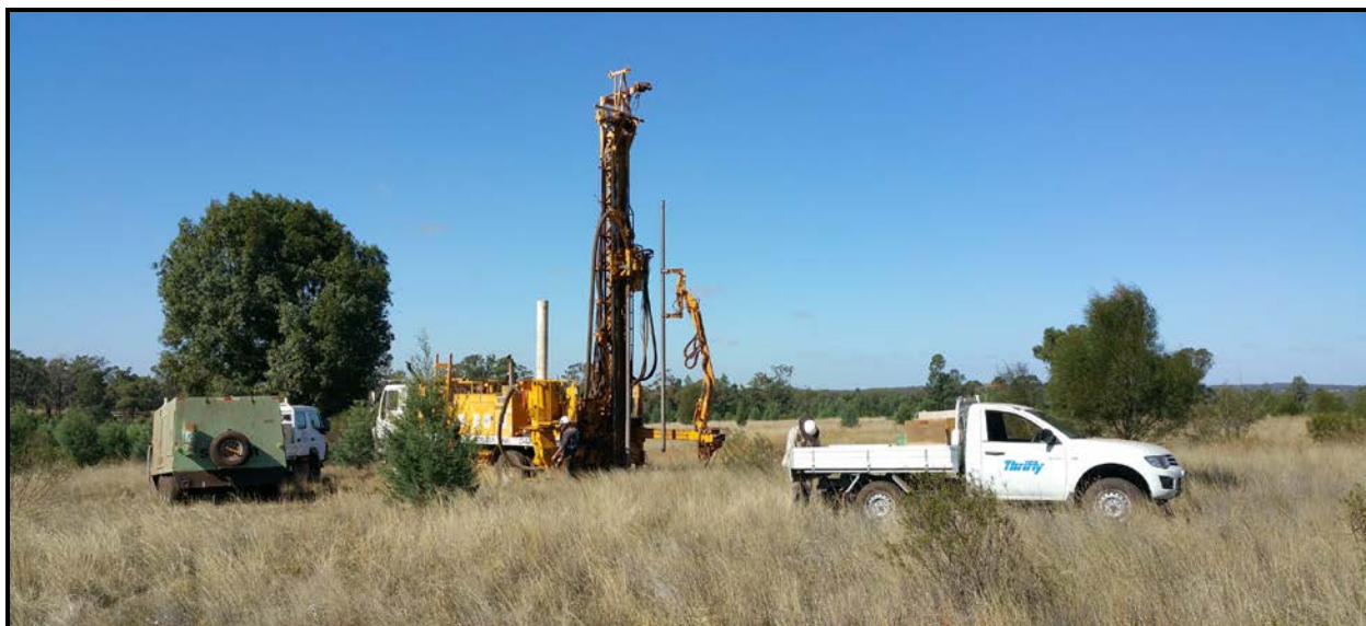
Figure 3: Drill rig on site at Syerston

Two meter samples were collected using a riffle splitter on the drill rig then sent to ALS in Brisbane via preparation lab in Orange to be assayed using both ICP-MS and Borate Fusion analytical techniques. Both Techniques were used to assess any differences in the scandium results for future reference and to assist with interpretation of historical drill results. One fully certified scandium standard and two identical duplicates per hole were also assayed for QA-QC purposes.