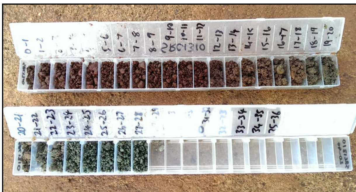
Figure 4: Hole SRC1310 chip tray showing 1m intervals through laterite profile, ending in basement ultramafic

Two meter samples were collected using a riffle splitter on the drill rig then sent to ALS in Brisbane via preparation lab in Orange to be assayed using both ICP-MS and Borate Fusion analytical techniques. Both Techniques were used to assess any differences in the scandium results for future reference and to assist with interpretation of historical drill results. One fully certified scandium standard and two identical duplicates per hole were also assayed for QA-QC purposes.