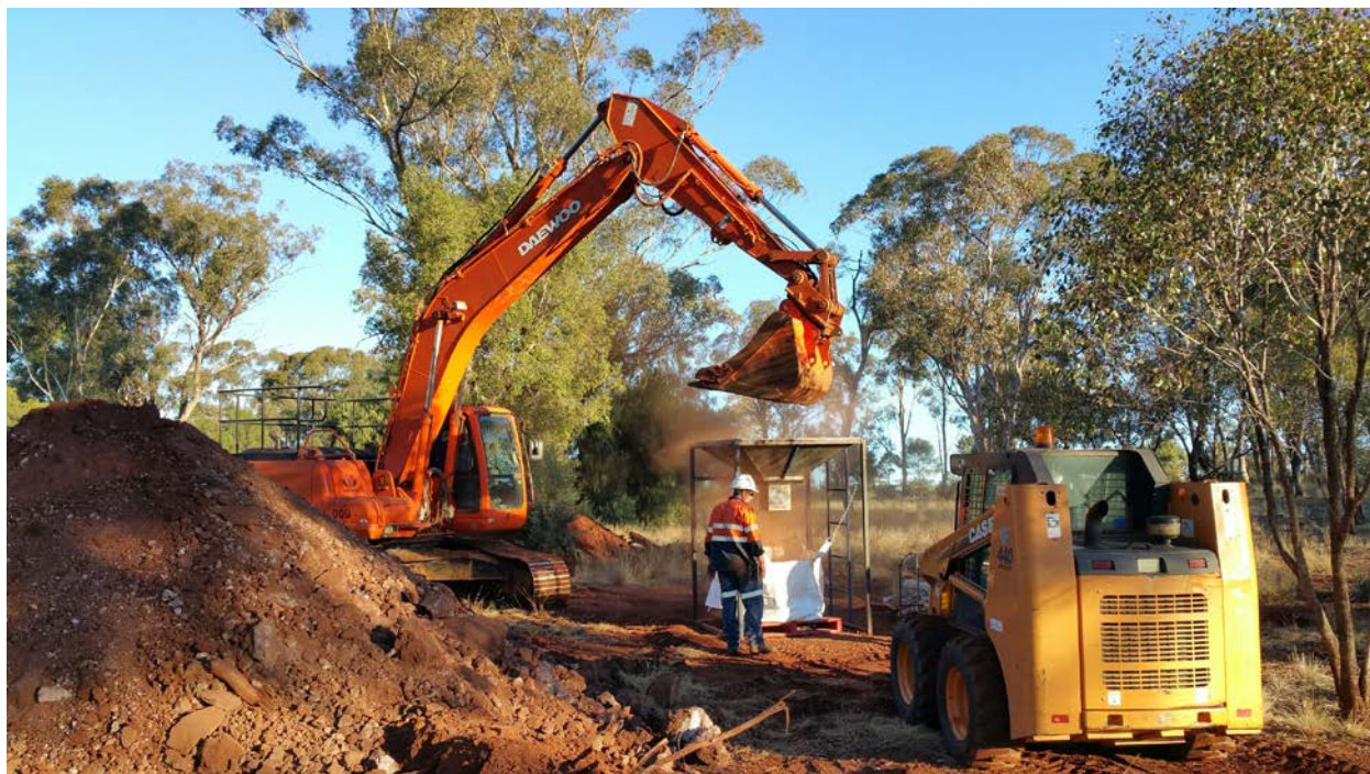
Bulk sampling of Syerston material for Scandium Oxide recovery pilot program

A pilot plant is currently being assembled in Perth. A bulk sample of Syerston material has been trucked to Perth and is currently being readied for processing to produce scandium oxide samples for customer testing and qualification purposes.