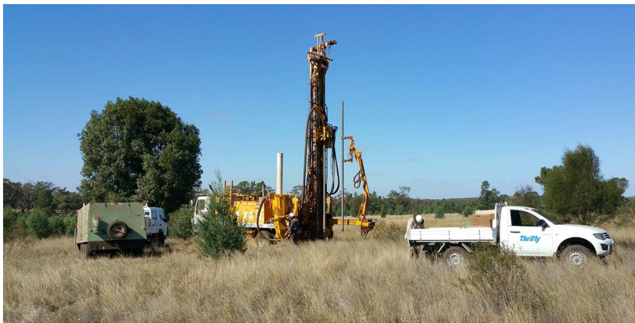
RC drilling at Syerston