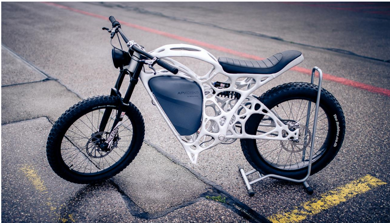
Figure 1: APWorks, a subsidiary of Airbus Group, has developed the Light Rider - a 3D printed Scalmalloy ® (aluminium-magnesium-scandium alloy) electric motorbike which, weighing in at just 35 kg, is about 30% lighter than most conventional e-motorcycles. The Light Rider is capable of going from 0 to 80 km per hour in seconds and can travel close to 60 km between charges

Airbus Group Innovations ( AGI ) is Airbus' global network of research and technology centres for future aerospace challenges. AGI is taking care of development, qualification and commercialisation of Scalmalloy ® , a patented 3D printing aluminium-scandium powder & direct manufacturing concept used in the production of high strength components for Airbus' fleet of aircraft.