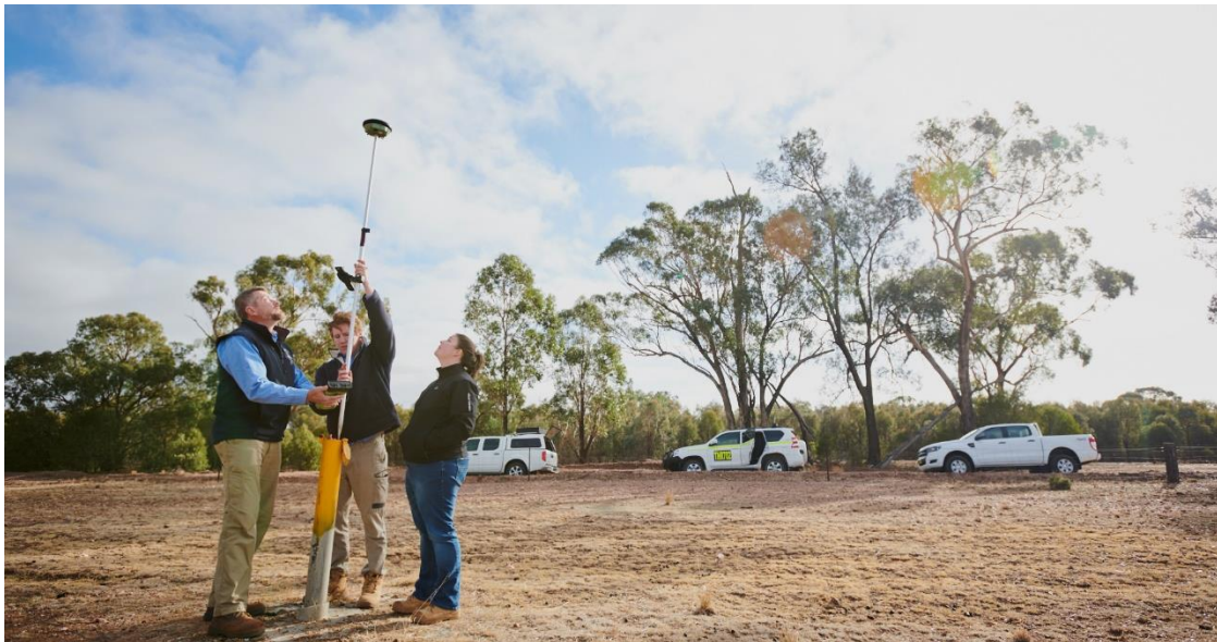
Figure 1: Survey works at Clean TeQ Sunrise

Clean TeQ's vision is to empower the clean revolution by applying our proprietary technologies to find better ways to solve the planet's most pressing environmental problems. With the development of the Clean TeQ Sunrise Project, and a fast-growing water treatment business, innovation remains at the core of our philosophy.