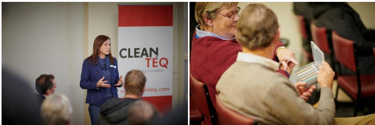
Figure 2: Clean TeQ's community consultation activities

The development of Clean TeQ Sunrise will support one of the most disruptive industrial transformations currently underway - the rapid electrification of the global automobile industry. Over the first decade of steady-state operations Clean TeQ Sunrise is forecast to produce high quality nickel sulphate and cobalt sulphate products in sufficient quantities to manufacture approximately 500,000 electric vehicles per annum 1 (using nickel-cobalt-manganese battery cathode chemistry). Over the initial 25-year mine life the DFS estimated: