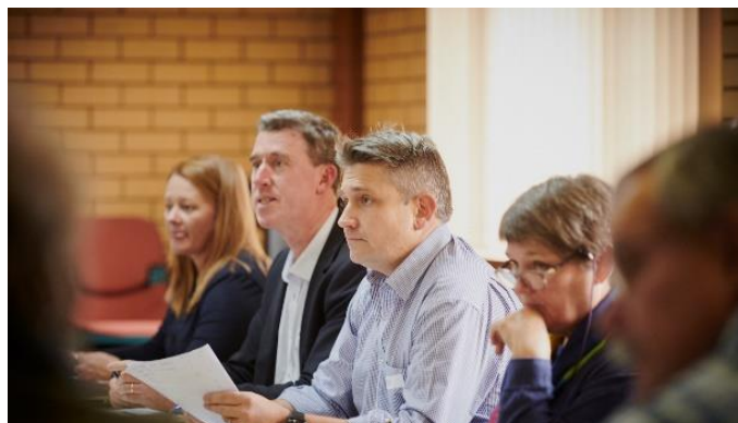
Figure 3: Clean TeQ’s community consultation activities

“We are committed to working together with our host communities as we seek to maximise the benefits of our presence, manage any impacts through leading environmental practices