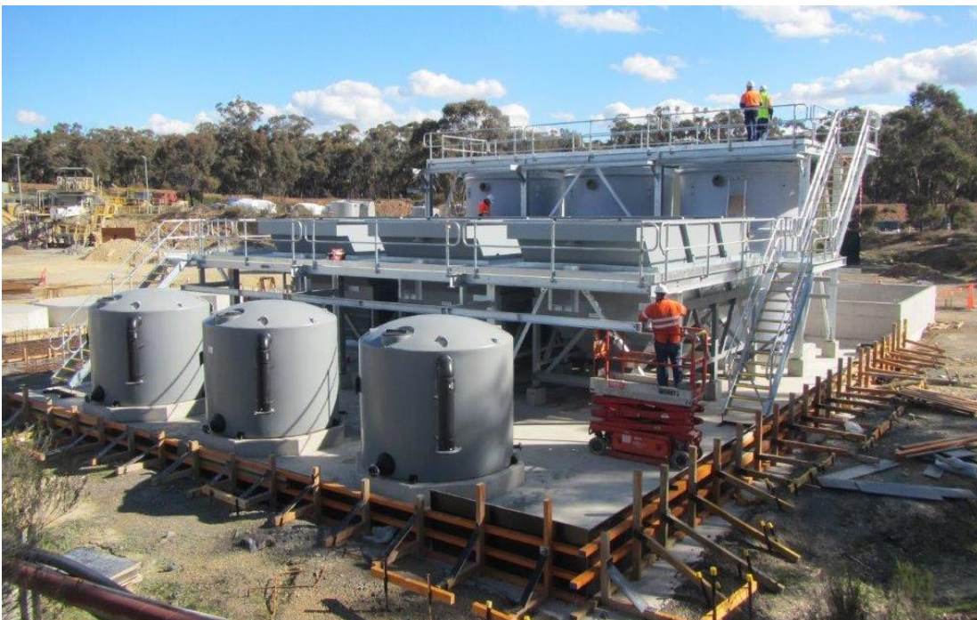
Figure 2: Clean TeQ's mine water treatment plant under construction at the Fosterville Gold Mine, Victoria

The plant is designed to deliver a more sustainable water management solution by treating mine process water for reuse in the mine operations.