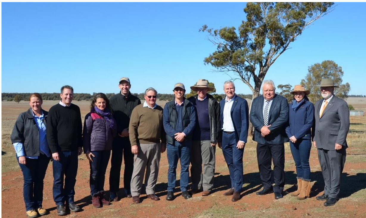
Figure 1 - Senior Members of Parliament, local Mayors and Clean TeQ representatives on site

Demonstrating the strong support the Project enjoys from all levels of government, the Company was delighted to host a delegation of senior Members of Parliament at the Clean TeQ Sunrise Project in July. The delegation included Senator the Hon. Matthew Canavan, Minister for Resources & Northern Australia, the Hon. Michael McCormack MP, Deputy Prime Minister and Member for Riverina, and the Hon. Mark Coulton MP, Member for Parkes, as well as the Mayors of the Shires of Lachlan, Parkes and Forbes.