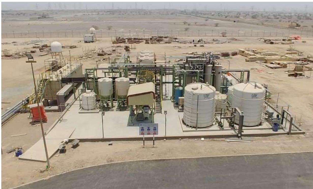
Clean TeQ's proprietary DESALX® (two-stage CIF®) technology plant in Oman

In late 2019 Clean TeQ announced the successful customer acceptance of commissioning and handover of a ground-breaking Continuous Ionic Filtration (CIF®) plant in Oman. Clean TeQ was engaged by Multotec, the Company's sales and delivery partner in Africa, under a design, procure and construct contract to deliver a waste water treatment system at an antimony processing facility in Oman. The Clean TeQ designed and supplied water treatment plant comprises the Company's DESALX® (two-stage CIF®) technology, chemical precipitation and reverse osmosis to recycle process water for re-use on site. The water treatment plant is designed to remove a range of deleterious elements from up to 200 tons of waste water per day.