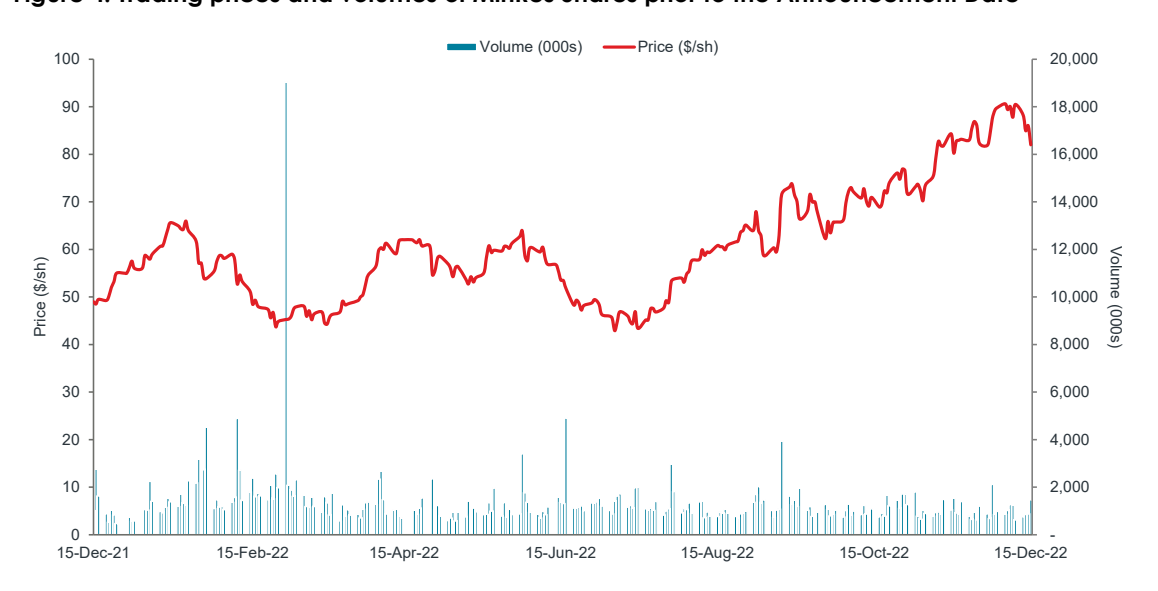
Figure 4: Trading prices and volumes of MinRes Shares prior to the Announcement Date

Set out below in Figure 4 is a chart showing trading prices and trading volumes of MinRes Shares for the 12 months to 15 December 2022, being the last full day of trading prior to the Announcement Date.