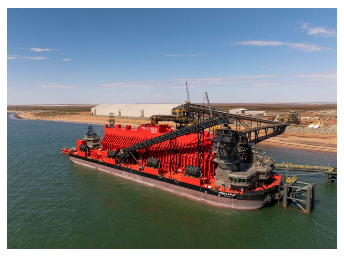
Figure 1: MinRes transhipper being loaded with Onslow Iron's first ore at the Port of Ashburton.