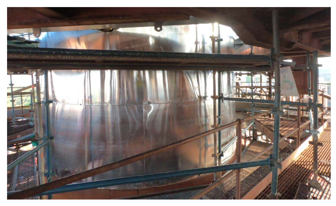
Figure 3: Syama Roaster repair completion