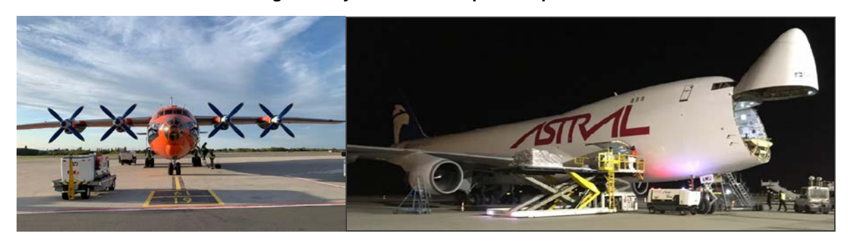
Figure 4: Syama Roaster repair air freight