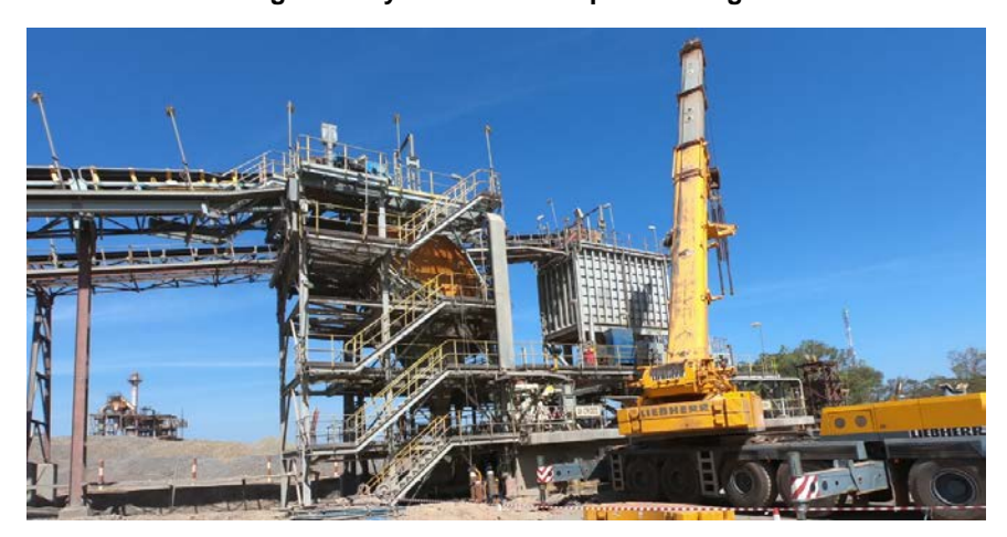
Figure 5: Syama Sulphide crushing circuit - new HP5 crusher installation