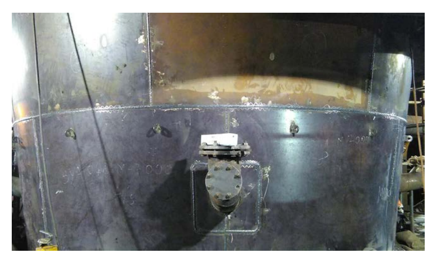
Figure 2: Syama Roaster steel replating