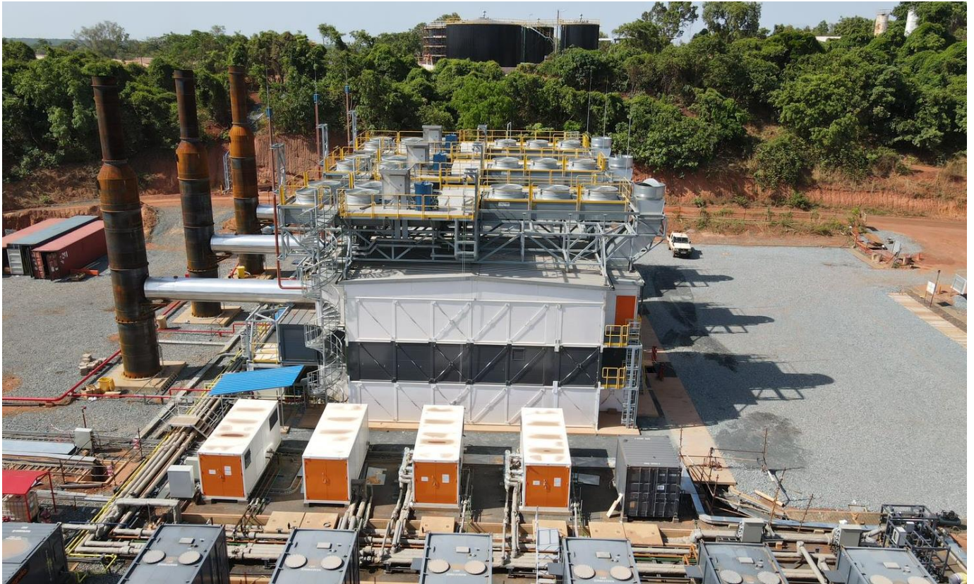
Figure 1: Completed Syama Hybrid Power Station with HFO storage in background