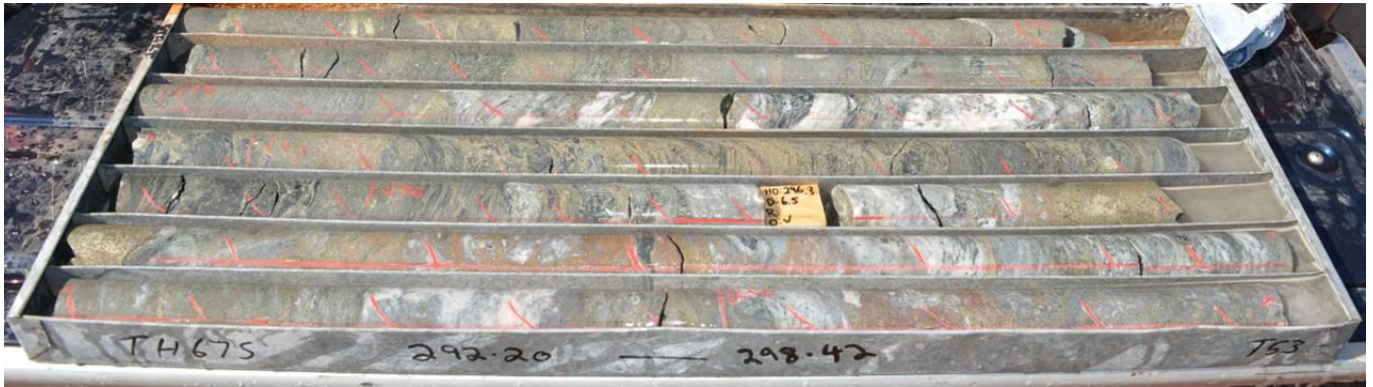
Figure 2 Massive sulphide mineralisation intersected in TH675 with abundant visible sphalerite and chalcopyrite