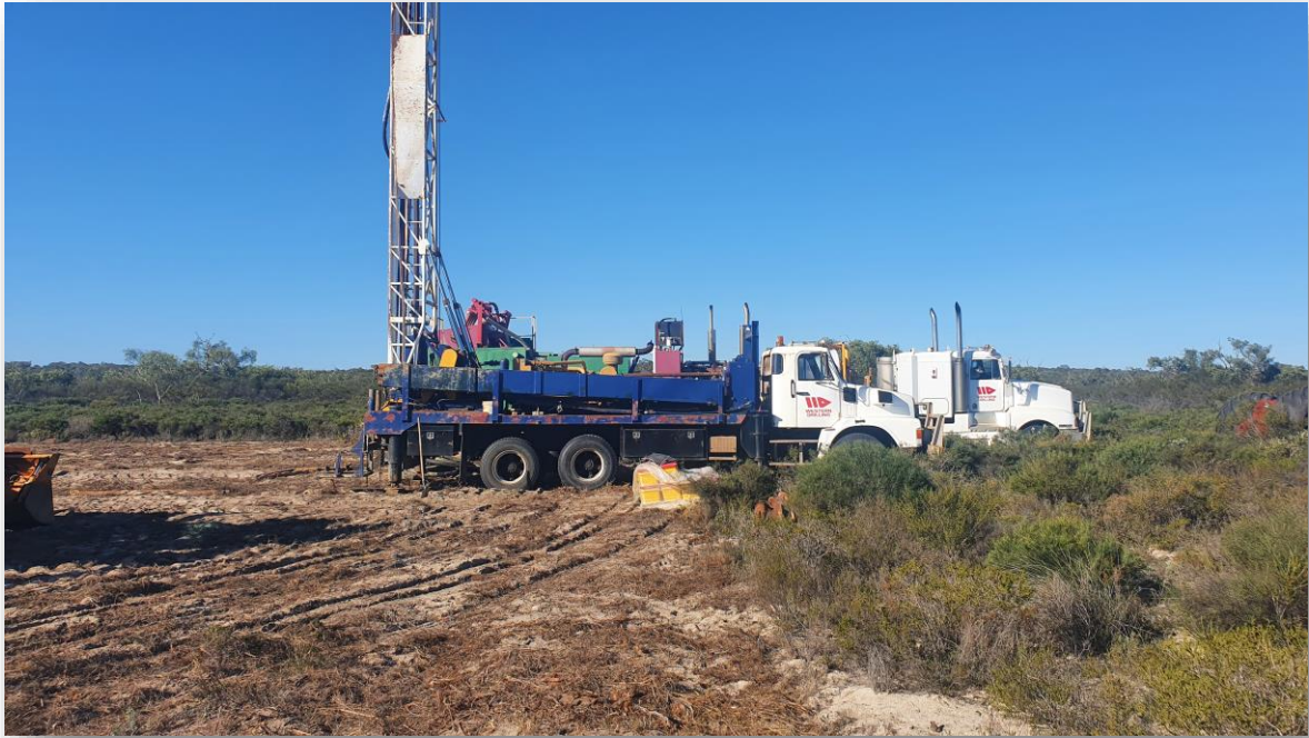
Figure 2: Water Bore Rig onsite

DWER has accepted the Company's application for an allocation of 900,000 kilolitres. The 5C licence to take water will be applied for once the bore construction and geophysical logging and test pumping results have been forwarded to DWER.