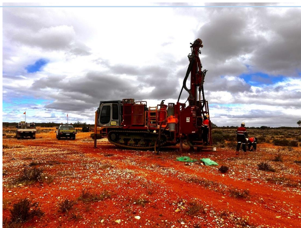
Figure 1: AC drill rig commencing exploration drilling adjacent to North Stanmore on 5 th September 2024